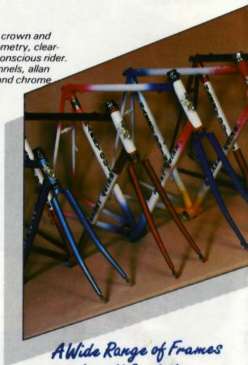
A Wide Range of Frames for all Cyclists....

Columbus Matrix tubing, short point lugs, short rake forks and Columbus track ends build up into a short, strong, responsive track frame for the keen beginner or experienced rider alike. Close clearance for Sprints or 700C wheels, no brazed fittings or brake drillings, allan key seat bolt. Complete with headset, chrome seat bolt and finished in stove enamel to your choice of colour